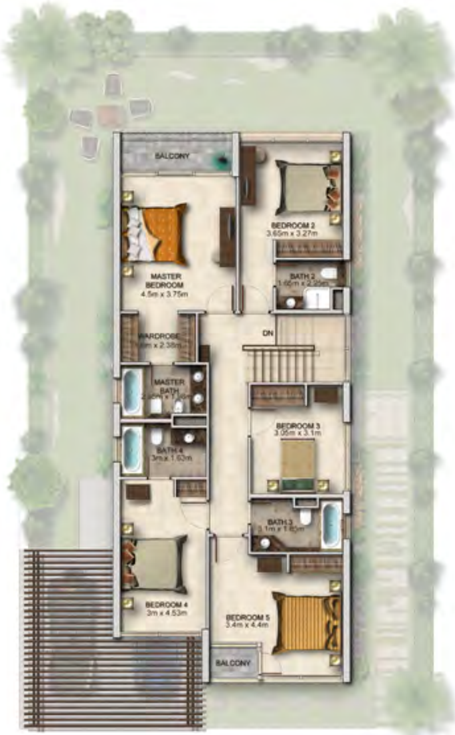
V-2 / L-2 FIRST FLOOR

V-2 available in Aster, Claret, Juniper, Mulberry, Primrose L-2 available in Sanctnary, Trixis