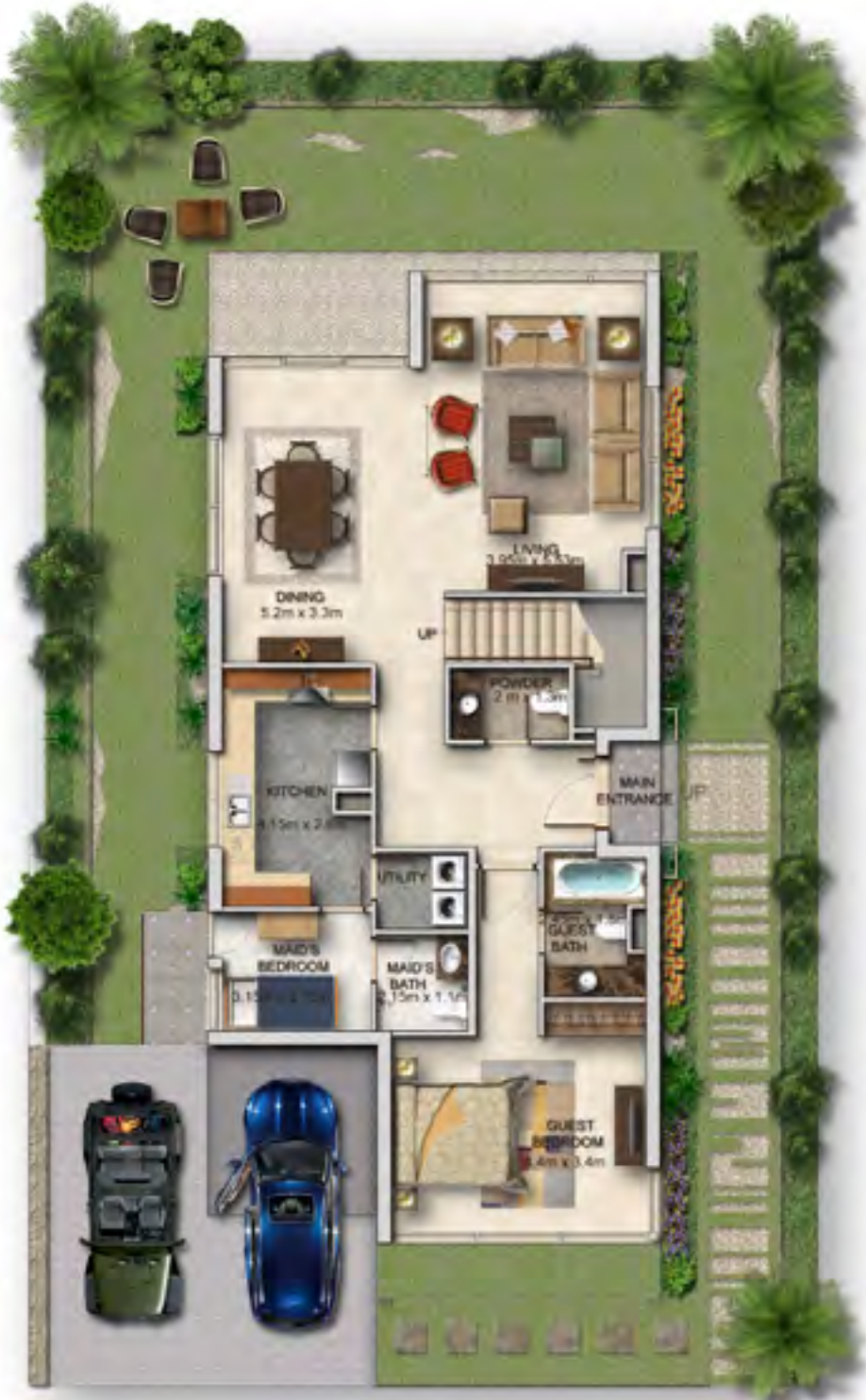
V-2 / L-2 GROUND FLOOR